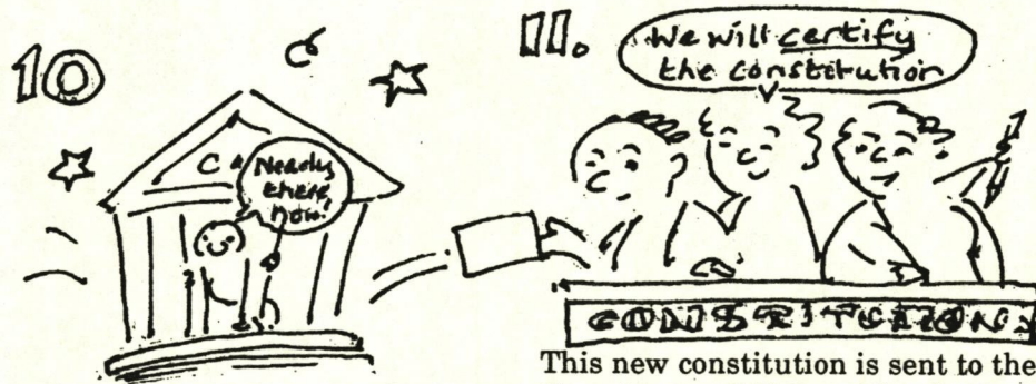
The CA makes changes to the draft of the constitution