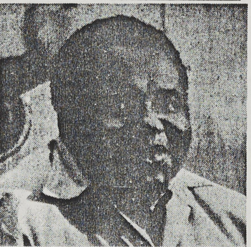
The ANC's Joe Modise