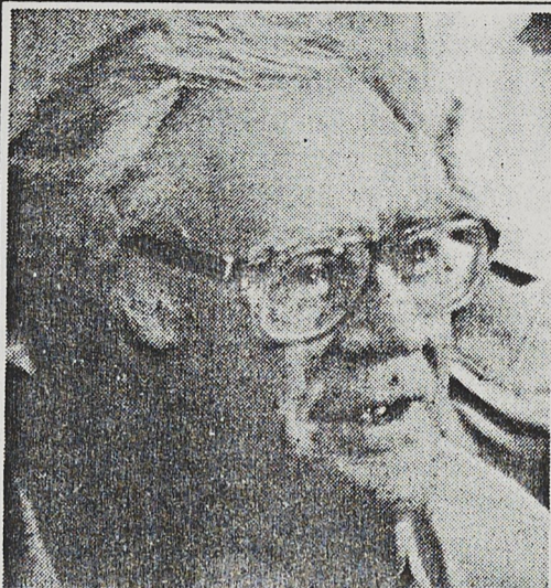
The SACP's Joe Slovo