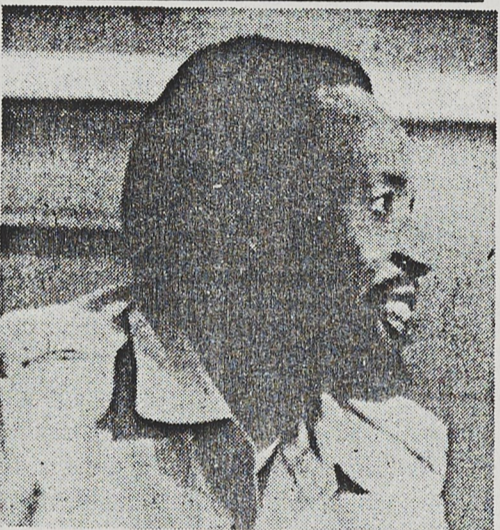
Chris Hani of the ANC