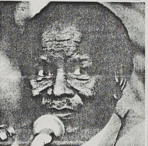
ANC President Oliver Tambo

can include anything from a British-style capitalist welfare state to the systems operative in China or Poland. In itself the reference to mixed economy in the ANC guidelines means little, and is far less 'revealing' than the ANC's left critics claim.